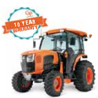
SSV Series Grand L Series