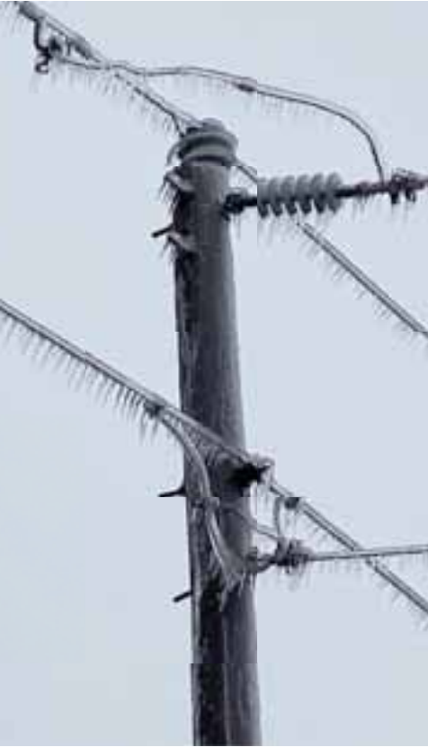
Thick layers of ice formed on equipment, including poles, wires, insulators and transformers. Photos by Journeyman Lineman Bobby Shortt.

bouncing up when the ice melted. Cotton Electric crews were joined by contractors to keep restoration efforts going around the clock. The final known residential outage was restored shortly after midnight Oct. 30.