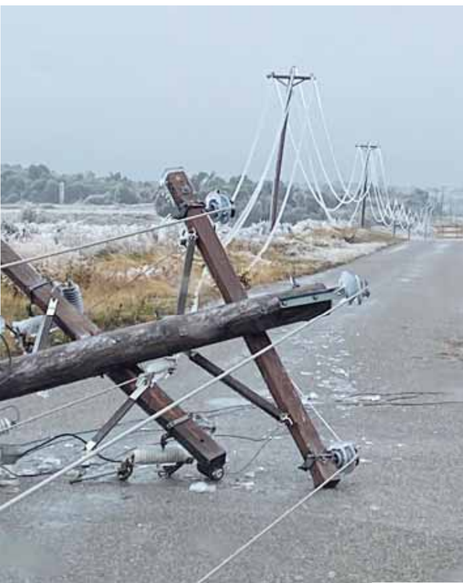
Ice-laden power lines put tension on poles, leading to roughly 50 broken poles replaced throughout Cotton Electric's service territory.