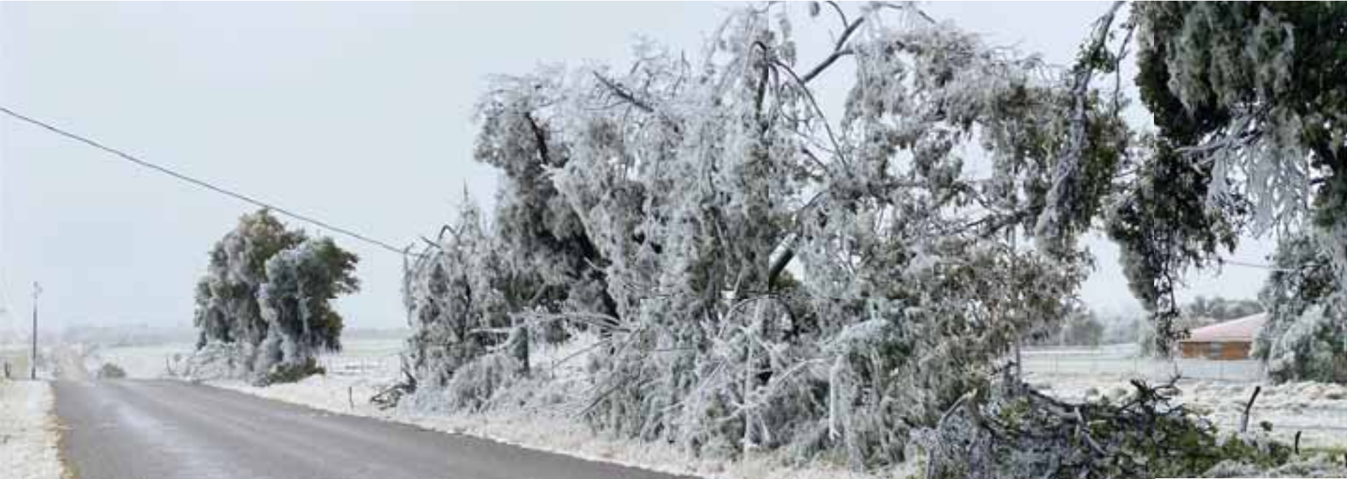
Ice-laden tree limbs broke and fell into power lines.