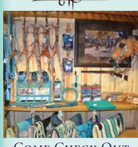
Come Check Out Our Increased Tack Inventory!