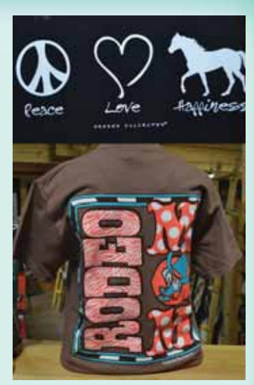
Equestrian Tee's For All!