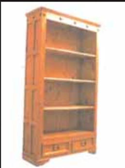
Indian 2 Drawer Bookcase Reg $439 for a Limited Time $299