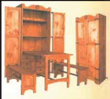
Cowboy Armoire w/ Star Reg $799 for a Limited Time $649

1511 NW CACHE RD. LAWTON, OK 580.699.SAVE (7283) Monday - Saturday 9:00 AM - 6:00 PM