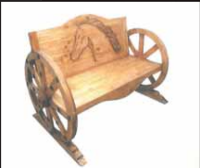
Wagon Wheel Bench w/ Horse Head for a Limited Time Save $119