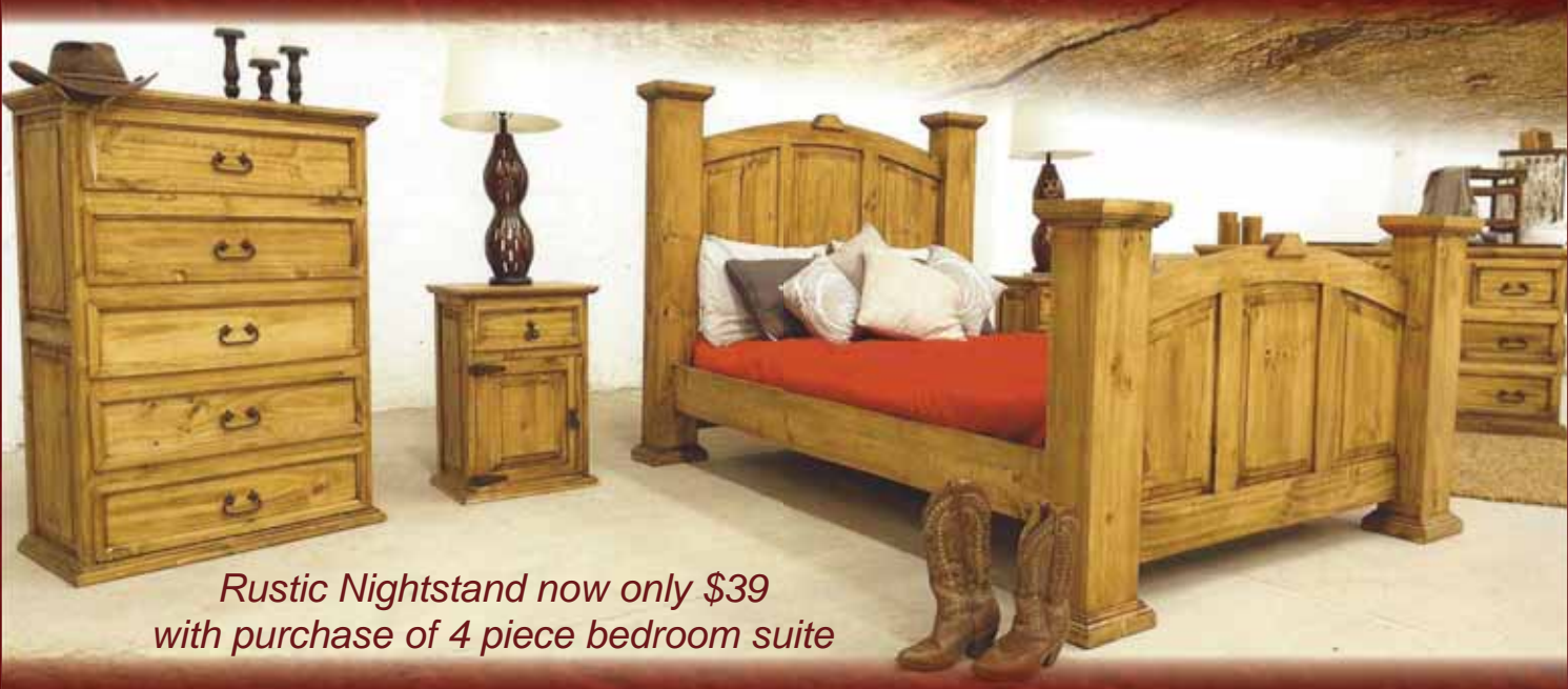
Rustic Nightstand now only $39 with purchase of 4 piece bedroom suite